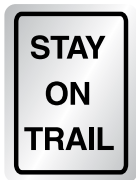
Stay On Trail