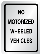
No Motorized Wheeled Vehicles